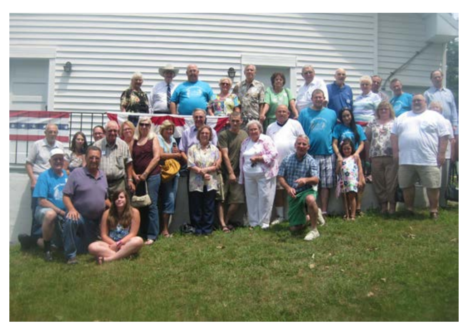
A part of the reunion group in front of the Shockeysville Church – July 8th 2012

March 2013 - Volume 39 Editors: Marie F Shockey - 928 Ruppenthal Road - Berkeley Springs, WV 25411 Lesley L Shockey - 516 Independence Road - Sandyville, WV 25275