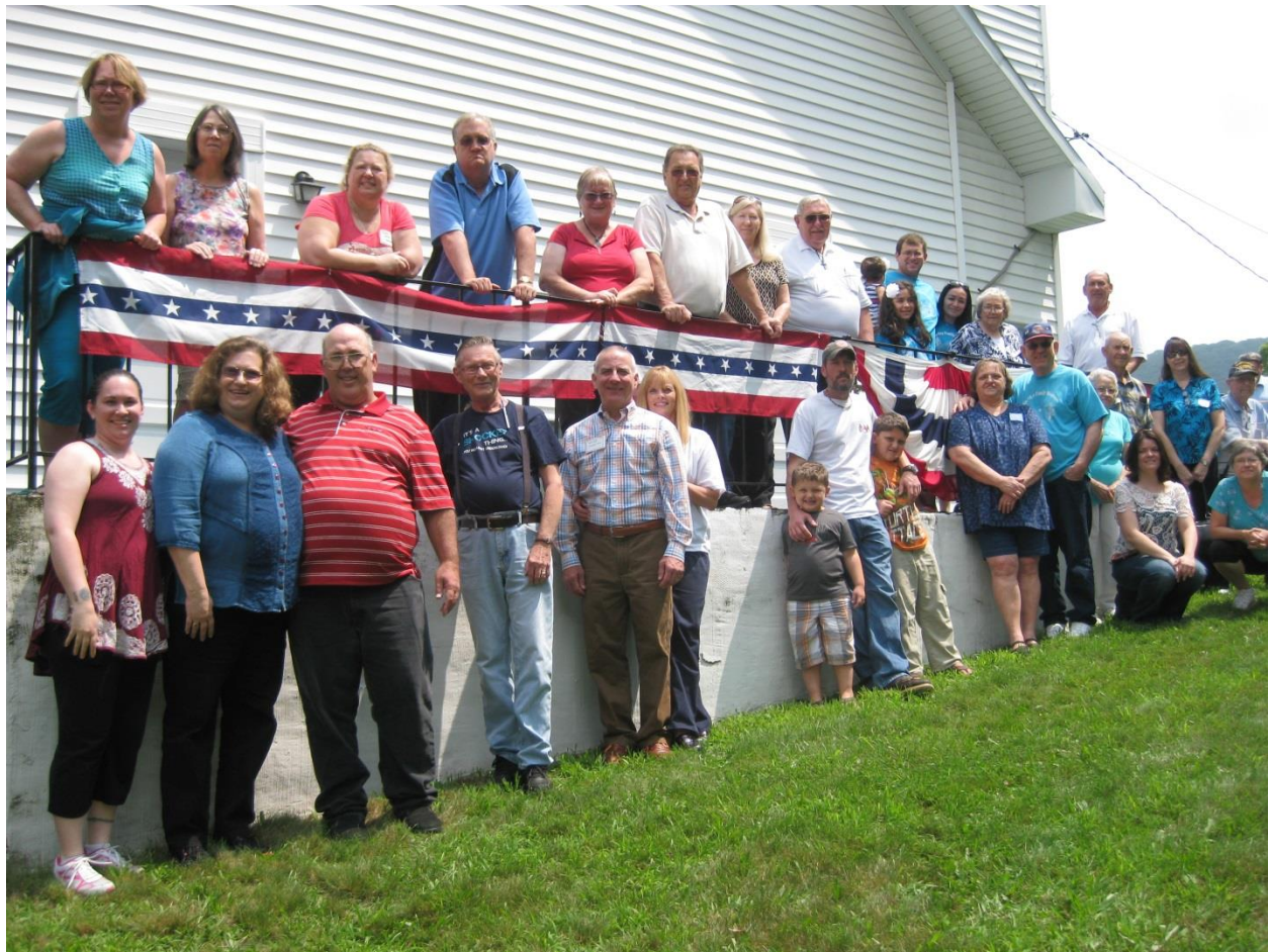
Some of those who attended the 2015 Shockey Family Reunion at Shockeyville Church